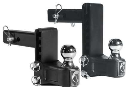
BXH10141 4" Drop/Rise 10K