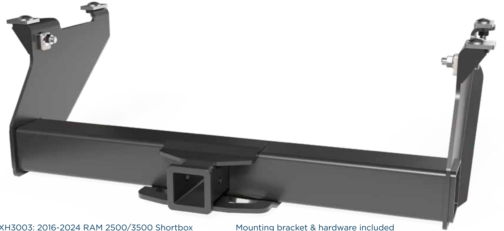
BXH3003: 2016-2024 RAM 2500/3500 Shortbox