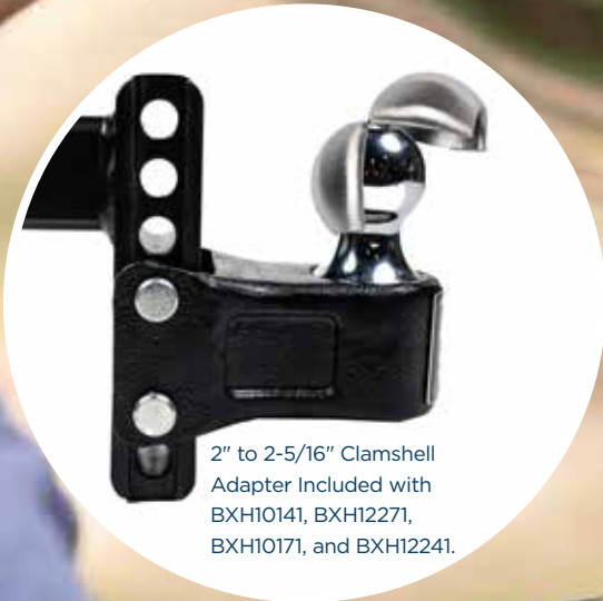
2" to 2-5/16" Clamshell Adapter Included with BXH10141, BXH12271, BXH10171, and BXH12241.