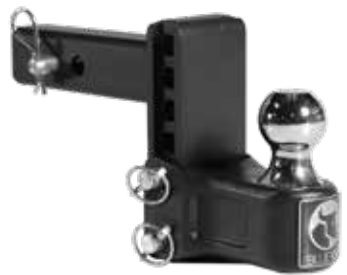
BX# BXH10141 Description 4" D/R, 2" S, 10K