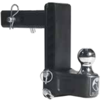
BX# BXH10171 Description 7" D/R, 2"S, 10K