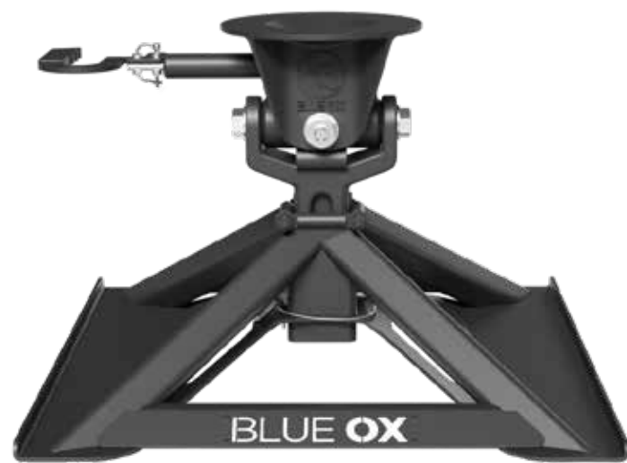
BXR2100 21K Gross Towing Capacity, 5K Vertical Load Limit