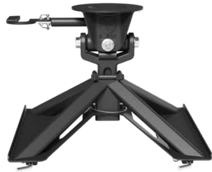
BXR2410 24K Gross Towing Capacity, 6K Vertical Load Limit