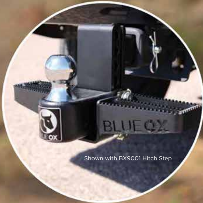
Shown with BX9001 Hitch Step