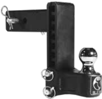
BX# BXH12241 Description 4" D/R, 2-1/2" S, 12K