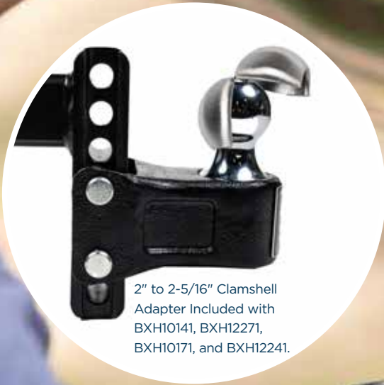
2" to 2-5/16" Clamshell Adapter Included with BXH10141, BXH12271, BXH10171, and BXH12241.