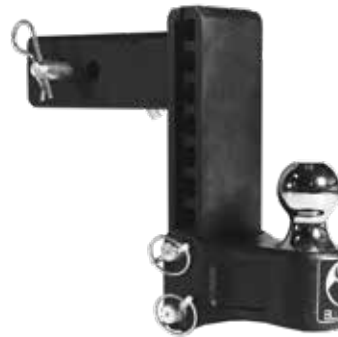
BX# BXH12241 Description 4" D/R, 2-1/2" S, 12K